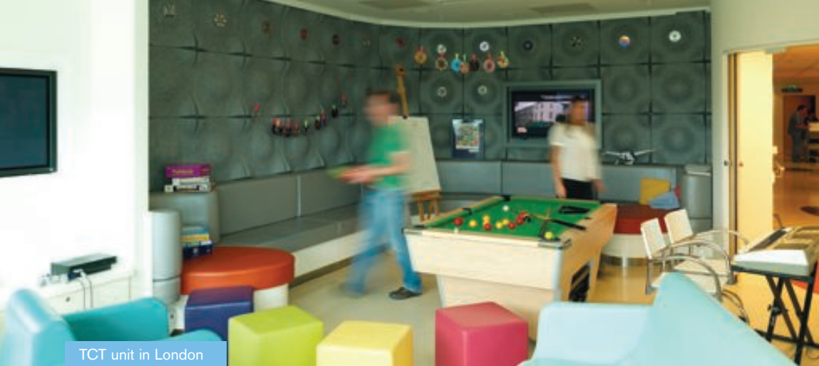
TCT unit in London